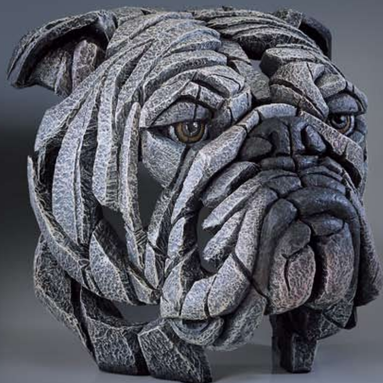
EDB13W Bulldog Bust (White)

Height - 320mm (12.5") Length - 290mm (11.4") Depth - 280mm (11")