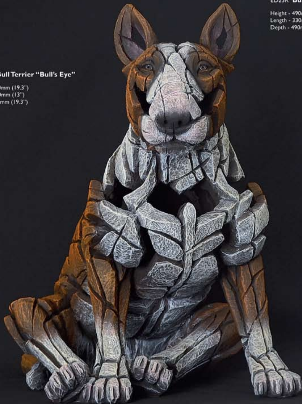
ED23R Bull Terrier (Red)

Height - 490mm (19.3") Length - 330mm (13") Depth - 490mm (19.3")