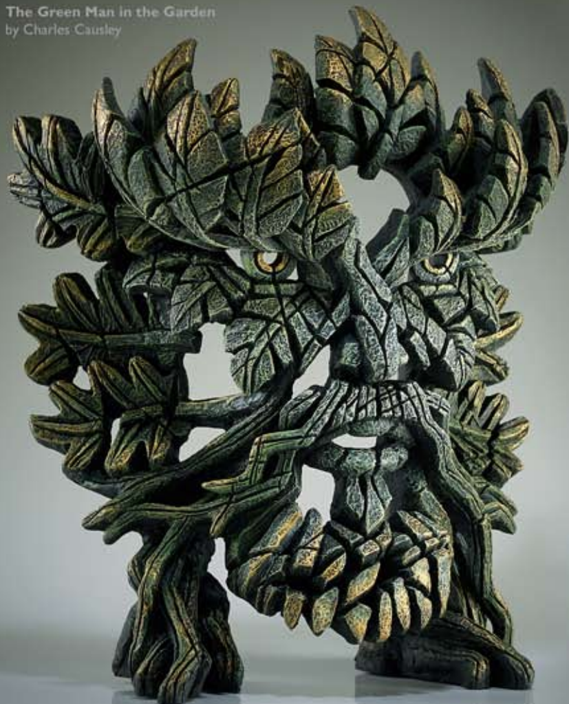
EDB16 Green Man Bust

The Green Man in the Garden by Charles Causley