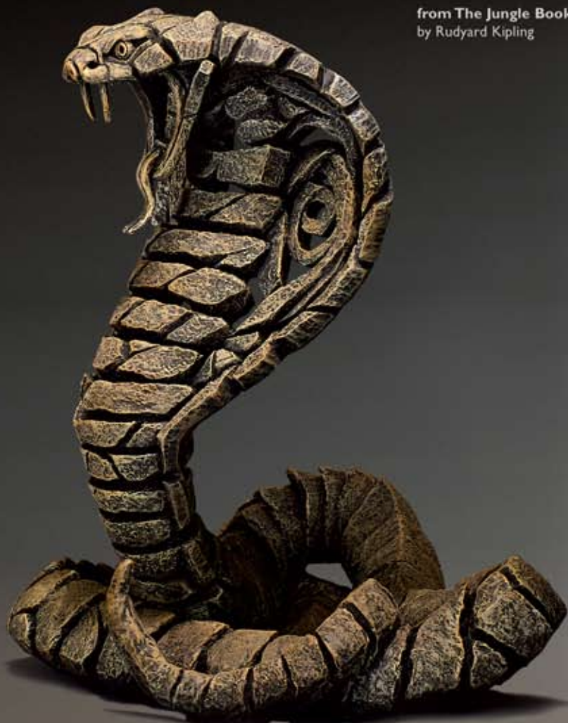
EDIID Cobra (Desert)

Height - 400mm (15.75") Length - 340mm (13.4") Depth - 295mm (11.6")