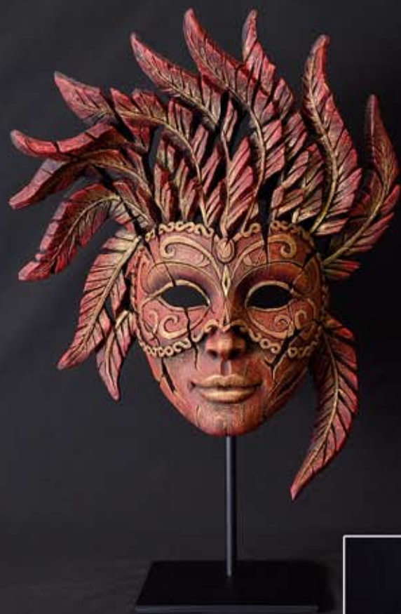
EDM02R Venetian Carnival Mask (Venetian Red & Gold)

Each mask comes complete with the metal stand pictured here, or it can be hung directly on to a wall.