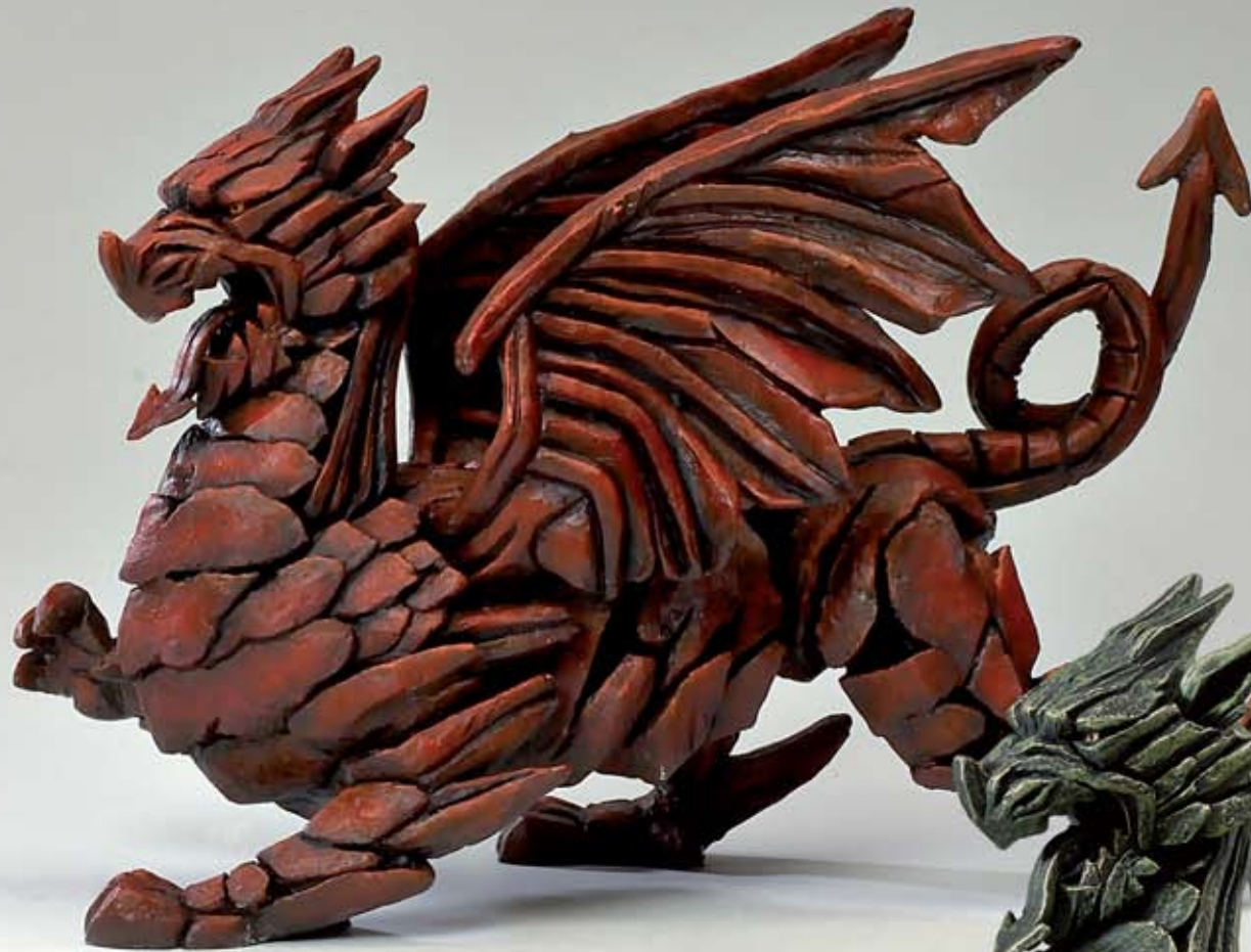
ED03 Dragon (Red)

Height - 203mm (8") Length - 305mm (12") Depth - 171mm (6.75")