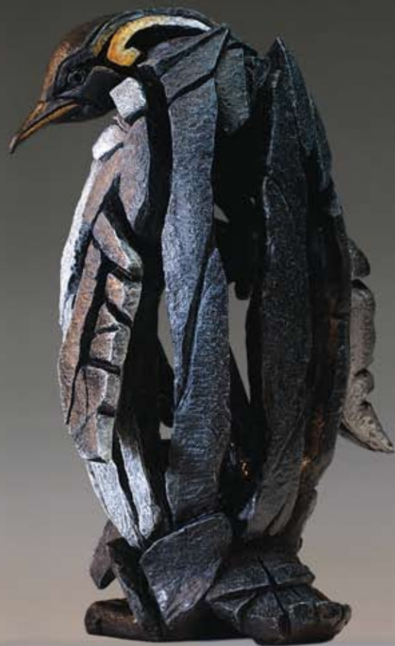
Penguin A Poem by Meish Goldish

The penguin's a bird that cannot fly But can swim like a torpedo! And on the ice It looks so nice Dressed in its own tuxedo!