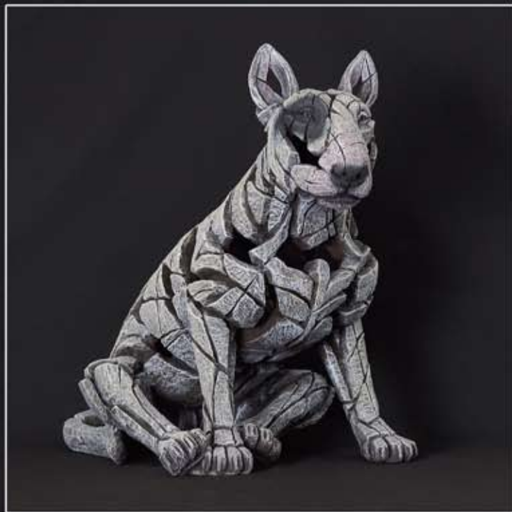
ED23BU Bull Terrier "Bull's Eye"

Height - 490mm (19.3") Length - 330mm (13") Depth - 490mm (19.3")