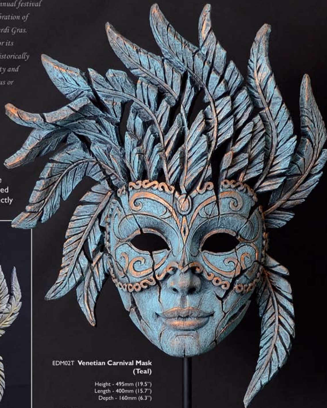
EDM02T Venetian Carnival Mask (Teal)

Height - 495mm (19.5") Length - 400mm (15.7") Depth - 160mm (6.3")