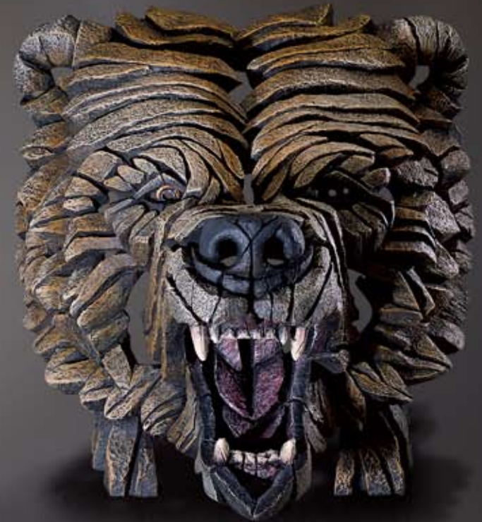
EDB10 Grizzly Bear Bust

Height - 390mm (15.5") Length - 420mm (16.5") Depth - 410mm (16")