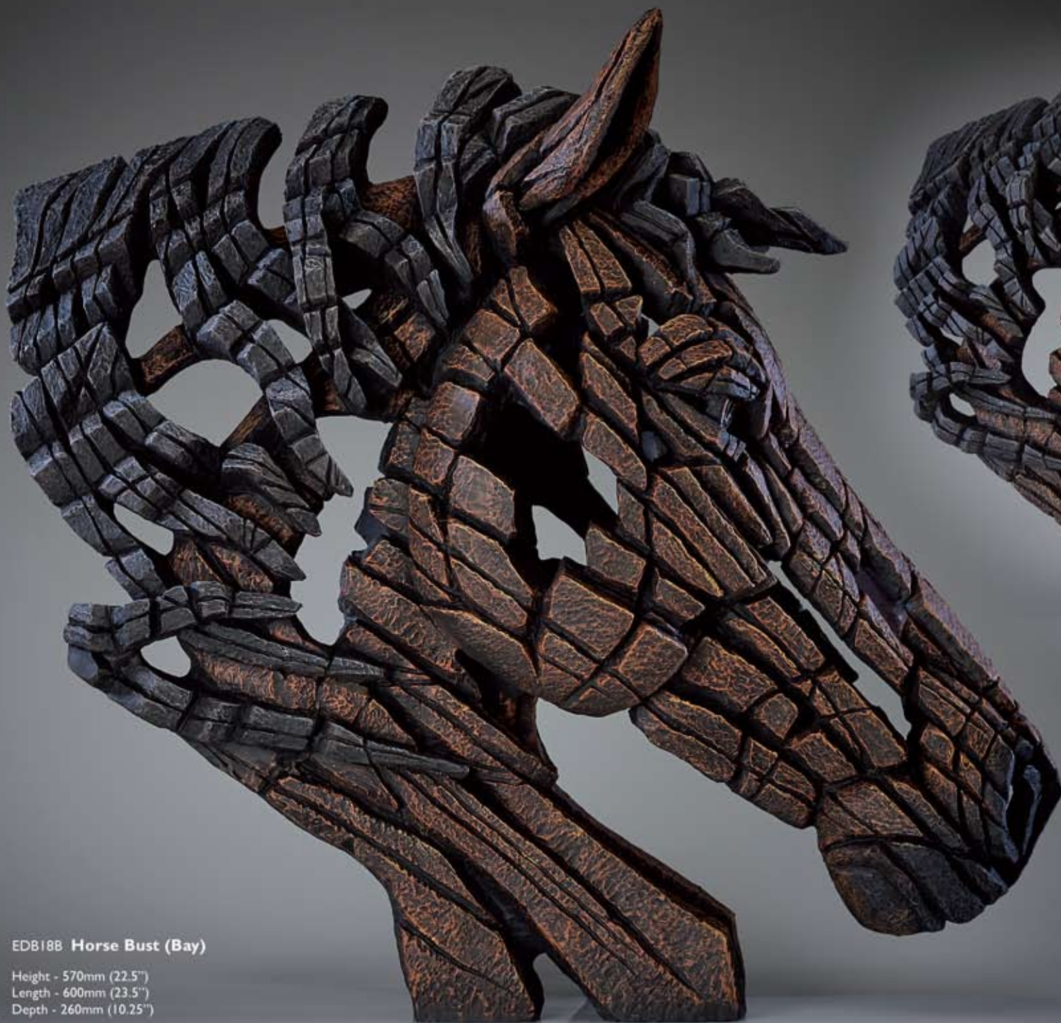
EDB188 Horse Bust (Bay)

Height - 570mm (22.5") Length - 600mm (23.5") Depth - 260mm (10.25")