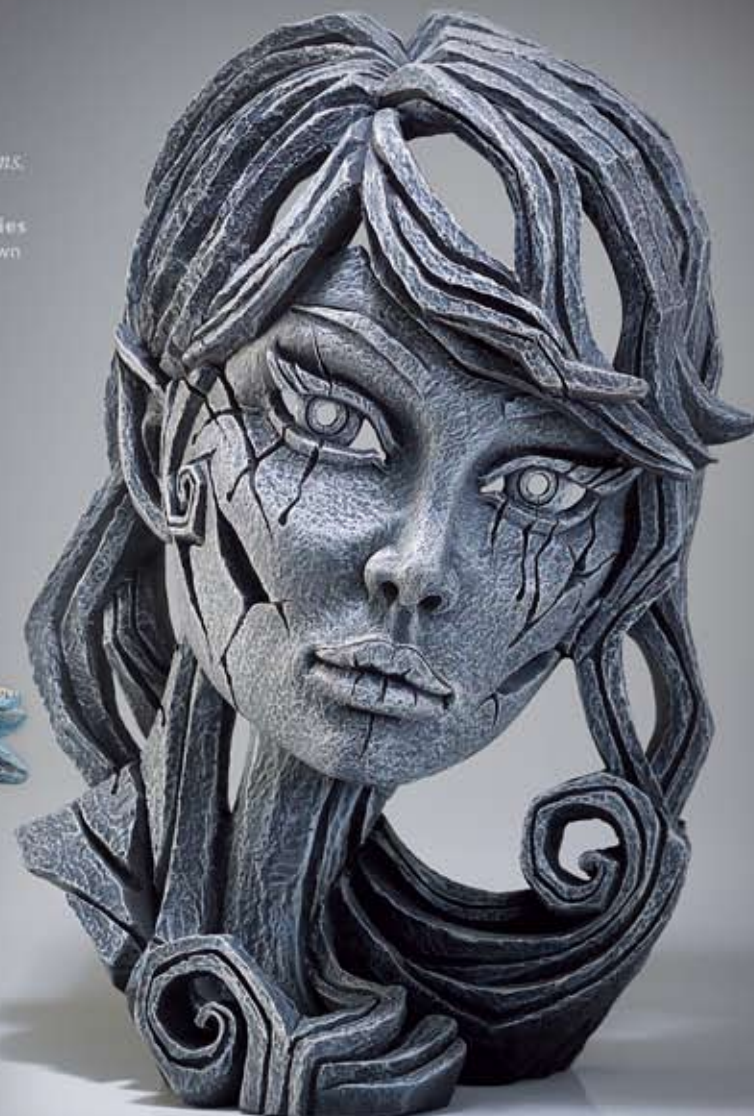
EDB19M Elf Bust (Mistral)

Height - 490mm (19.25") Length - 340mm (13.5") Depth - 220mm (8.75")