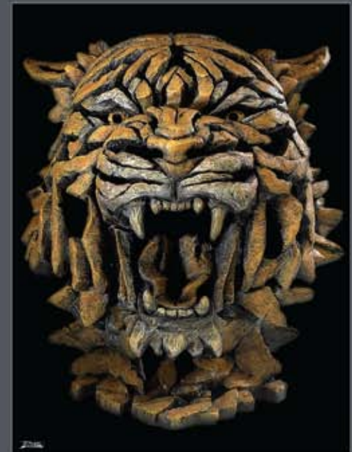
EDCO6 Tiger Limited Edition 200

Height - 800mm (31.5") Width - 600mm (23.6") Depth - 40mm (1.5")