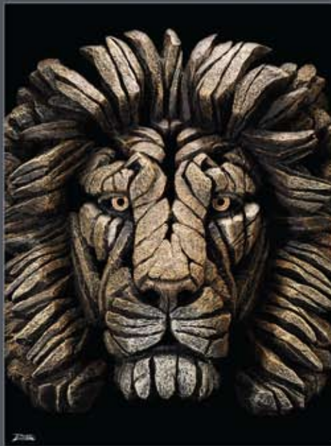
EDCO2 Lion Limited Edition 200

Height - 800mm (31.5") Width - 600mm (23.6") Depth - 40mm (1.5")