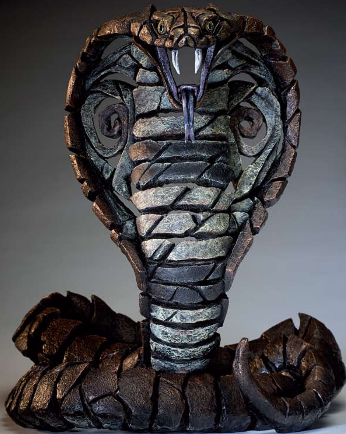
EDII Cobra (Copper Brown)

Height - 400mm (15.75") Length - 340mm (13.4") Depth - 295mm (11.6")