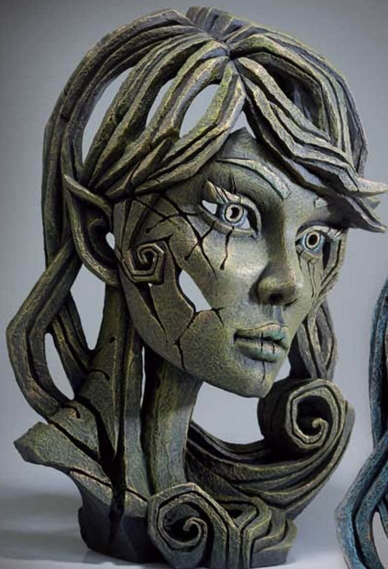
EDB19 Elf Bust (Leaf)

Height - 490mm (19.25") Length - 340mm (13.5") Depth - 220mm (8.75")