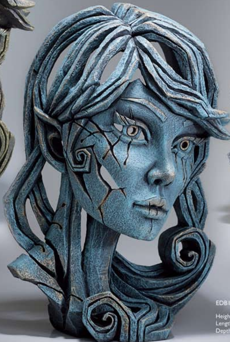
EDB19A Elf Bust (Aqua)

Height - 490mm (19.25") Length - 340mm (13.5") Depth - 220mm (8.75")