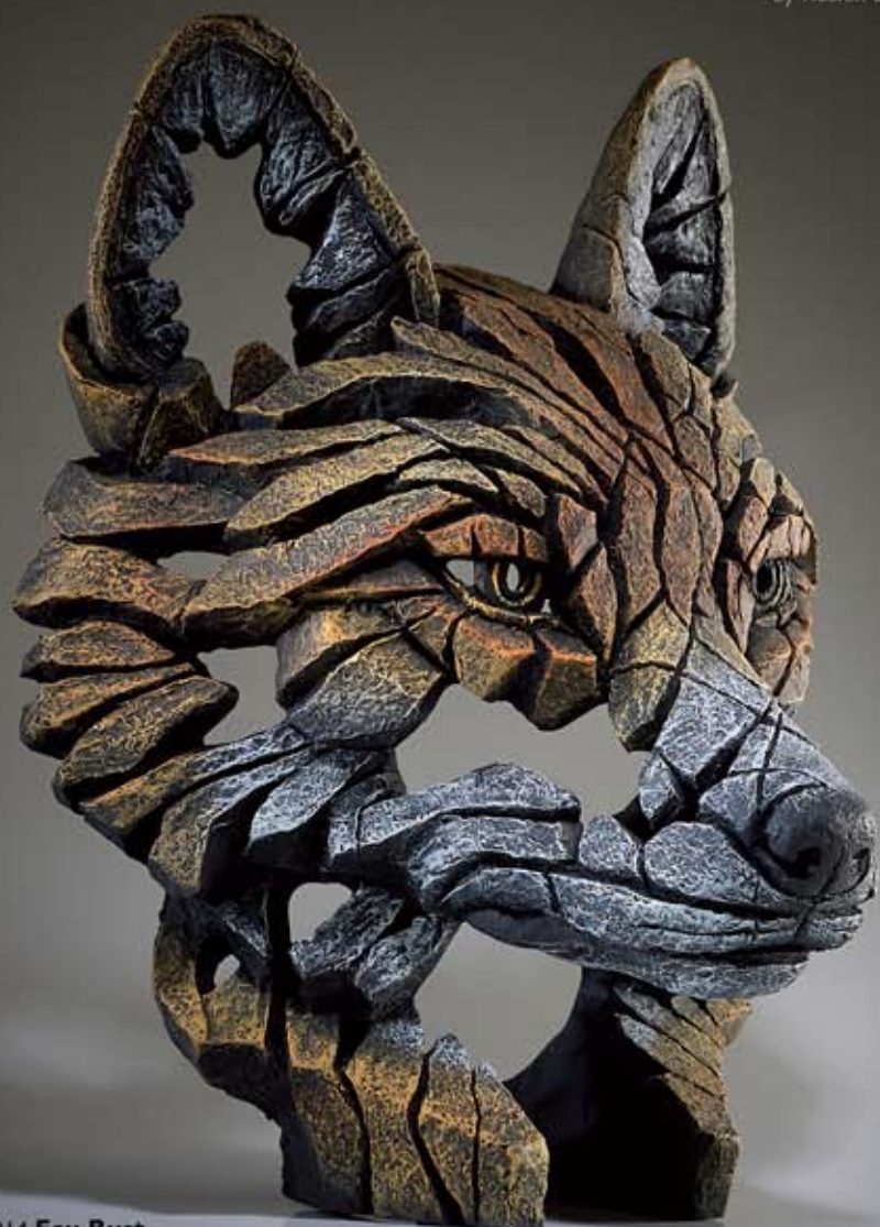
EDB14 Fox Bust

Height - 410mm (16") Length - 330mm (12.5") Depth - 300mm (12")