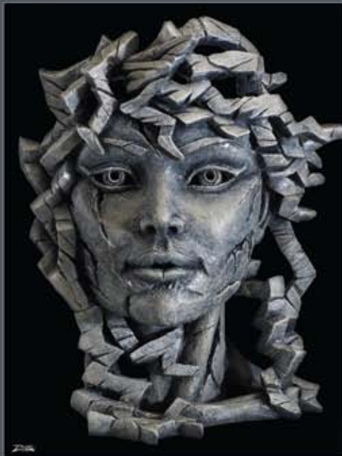
EDCO4 Venus Limited Edition 200

Each canvas is 60 x 80cm and will come complete with a wall hanging kit.