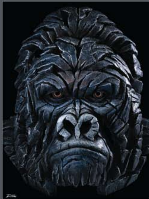
EDCO5 Gorilla Limited Edition 200

Height - 800mm (31.5") Width - 600mm (23.6") Depth - 40mm (1.5")