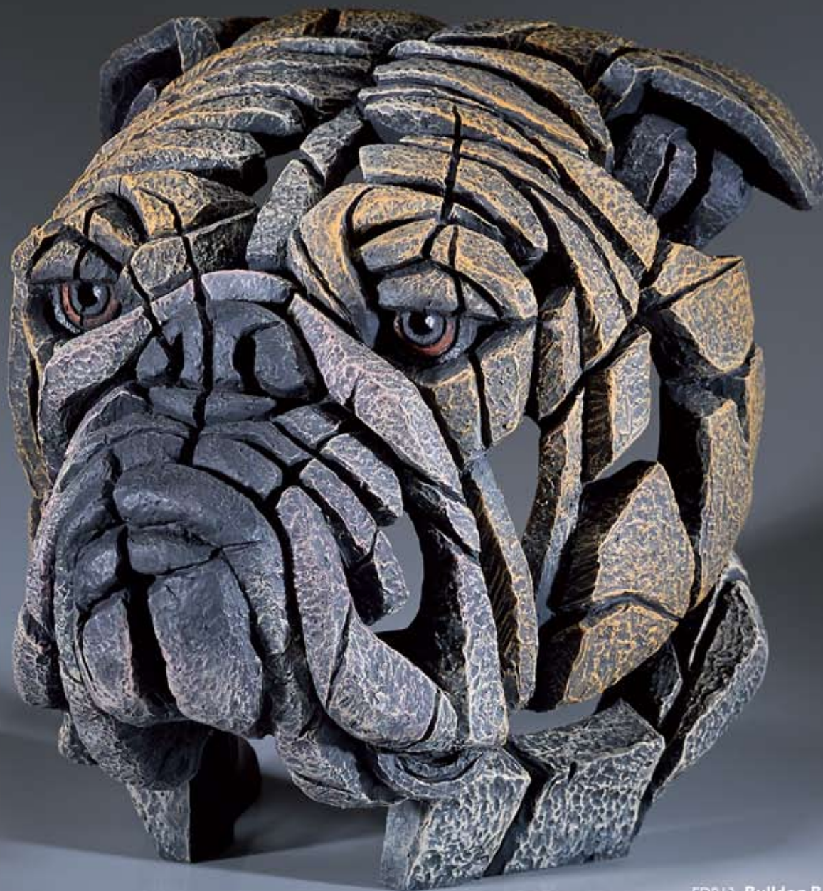
EDB13 Bulldog Bust

Height - 320mm (12.5") Length - 290mm (11.4") Depth - 280mm (11")