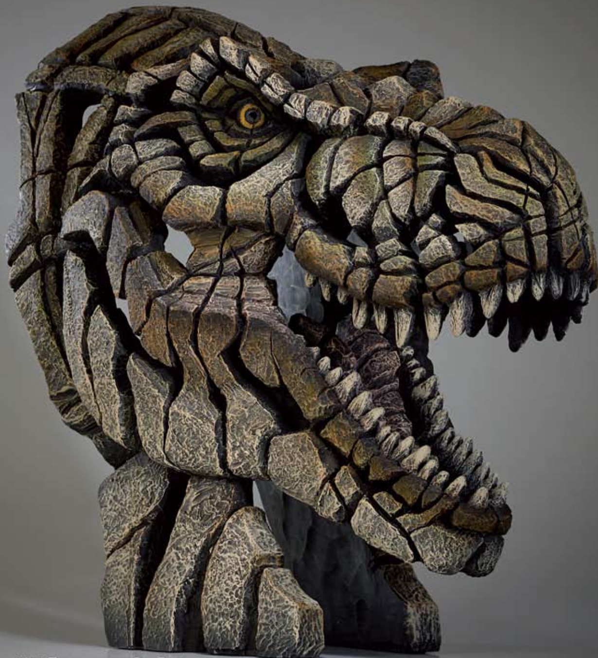
EDB15 Tyrannosaurus Rex Bust

Height - 500mm (19.5") Length - 530mm (20.8") Depth - 310mm (12.2")