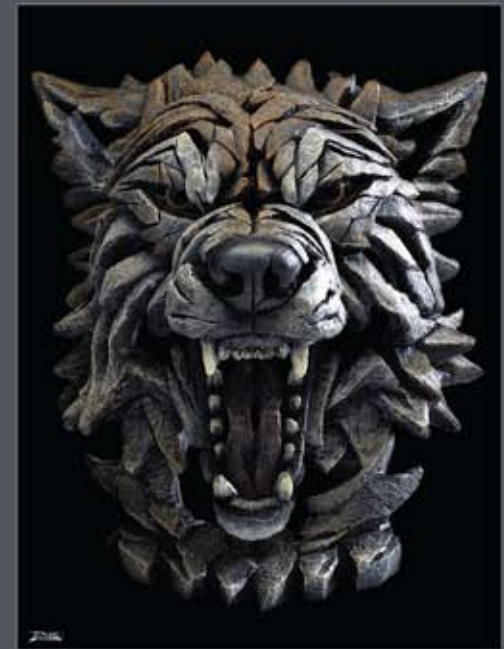
EDCO3 Wolf Limited Edition 200

Height - 800mm (31.5") Width - 600mm (23.6") Depth - 40mm (1.5")