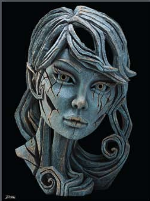
EDCO1 Elf Limited Edition 200